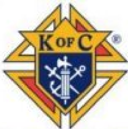
St. Ignatius of Antioch Council 7621 Tarpon Springs, Florida

COUNCIL #7621 - TARPON SPRINGS, FL - 1/2024